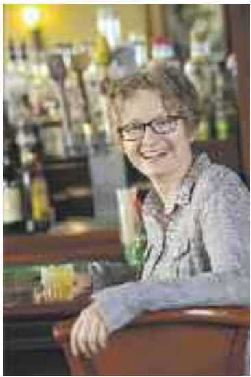
Amy Stewart Photo Delightful Eye Photography

Every fruit on the planet, every seed, nut, flower, tree, shrub and fungi – no matter the taste – has been harvested, fermented, brewed and turned into alcohol. The pursuit of great and sometimes dangerous drinks has led to fabulous fun and fatal folly ever since botany and chemistry got married and appeared in bottled form.